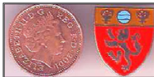
Enamelled gold coloured Badge On Brass [Size of a 1p coin]