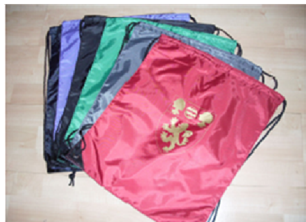
Gatton Sports Bag in various colours