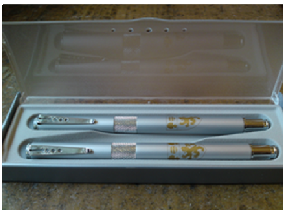
Ballpoint & Fountain Pen Set with printed logo