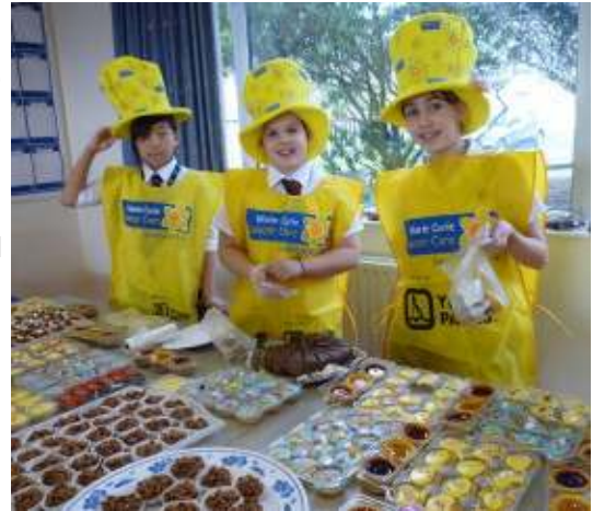
Year 6 Prefects at the cake sale