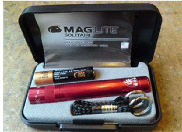
MAGLITE -Dark red with laser engraved school logo