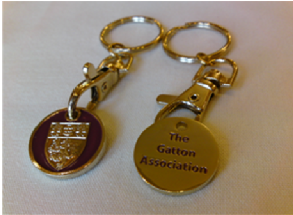
Gold coloured Maroon Key ring with gold trolley coin