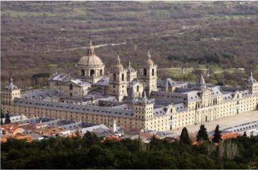
Real Colegio Alfonso XII