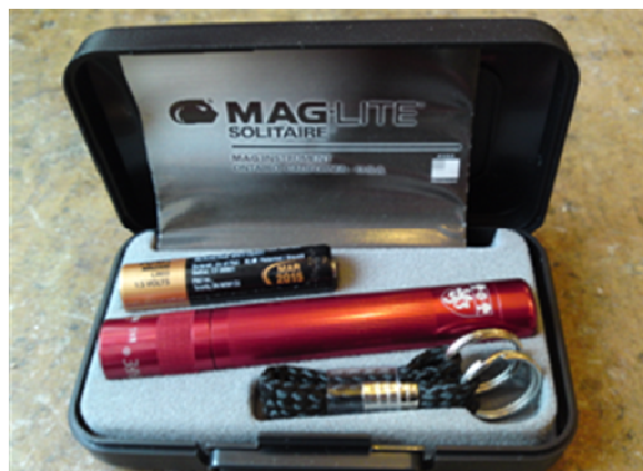
MAGLITE -Dark red with laser engraved school logo