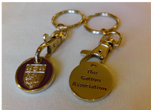
Gold coloured Maroon Key ring with gold trolley coin