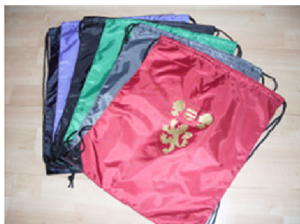
Gatton Sports Bag in various colours