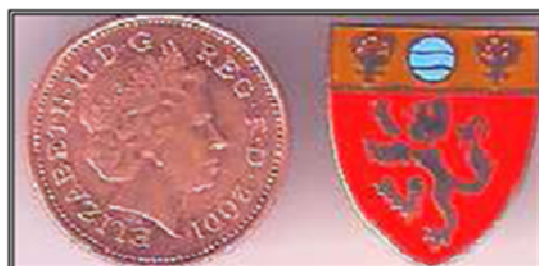
Enamelled gold coloured Badge On Brass [Size of a 1p coin]