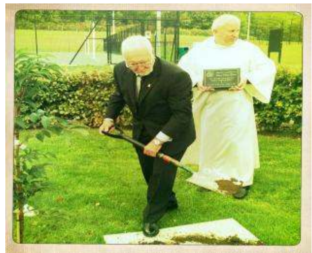
Mr Cull helping to plant the tree