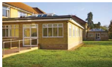
Ground floor extensions to Albert and Elizabeth houses