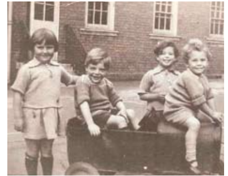
Children at the Alexandra Orphanage

2010 is the year when the school celebrates 250 years since the first child started at The Orphan Working School. To help us celebrate, we hope a Royal Visitor will join us for a thanksgiving service later this year.