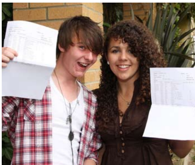
Delighted pupils celebrate their GCSE results

When the school had its last Ofsted inspection in June 2008, it was awarded 'outstanding' for every category. Nevertheless, there is still a constant focus on improvement and this showed with the GCSE results in August 2009. For another successive year, the results were an improvement on the previous year