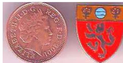
Size of One Pence Coin

of £1.50 for post and packaging. Every time a badge is purchased it helps raise money for the Gatton Association